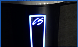
ELITE IV LED CORNERS